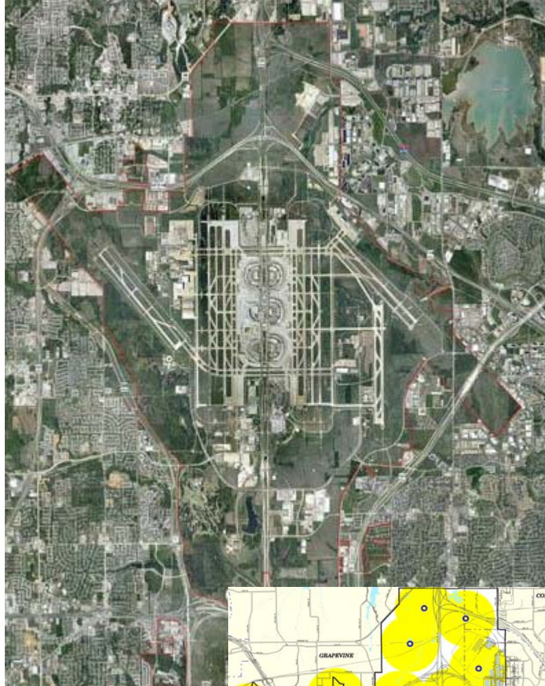
Dallas Fort Worth International Airport Potential Area of Exploration