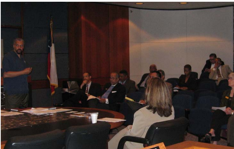
DFW hosted a meeting for local minority Chambers and stakeholders May 31.

Lastly, various DFW employees listed and discussed business opportunities with the group, including the oil and gas lease solicitation, concession opportunities, human resource services and various construction projects.